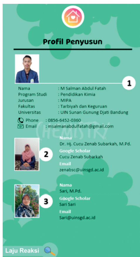
Figure 8: Display of the profile menu.

the e-module show an average percentage value of 88.9% which indicates that the material in the e-module is very valid so that it is feasible to apply at the next stage, namely limited trials [8].