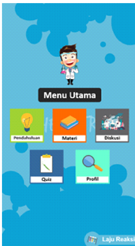
Figure 3: Main menu display.

reaction rates, as well as integration of reaction rate material with Islamic values taken from the Al-Qur'an and hadith.