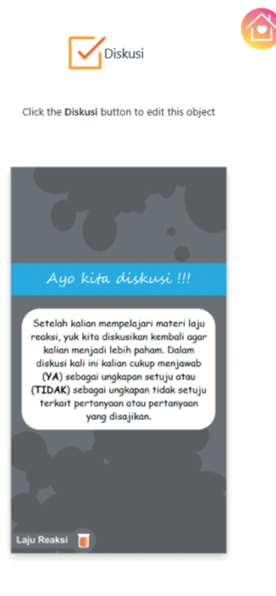
Figure 6: Display of the discussion menu.