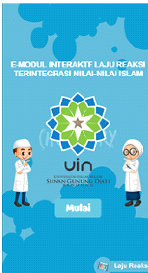
Figure 2: View opening screen.

learning objectives using the e-module. Figure 5 shows the display of the material menu. Complete reaction rate material is presented in accordance with KD 3.6, equipped with pictures and animations, learning videos related to concepts and factors that influence