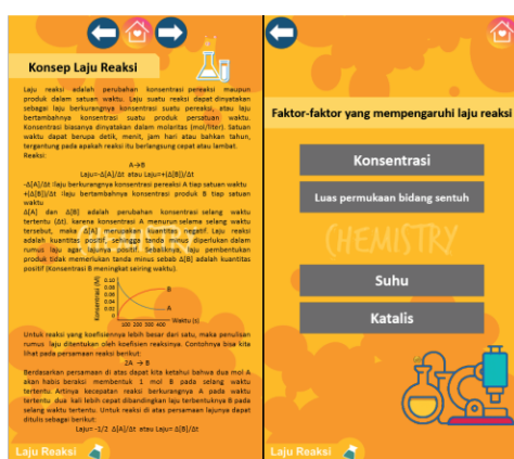
Figure 5: Content menu display.

researchers that can be used as a means of communication, consultation, and conveying criticism or suggestions for e-module learning media. The next step, students can return to the main menu page or end learning.