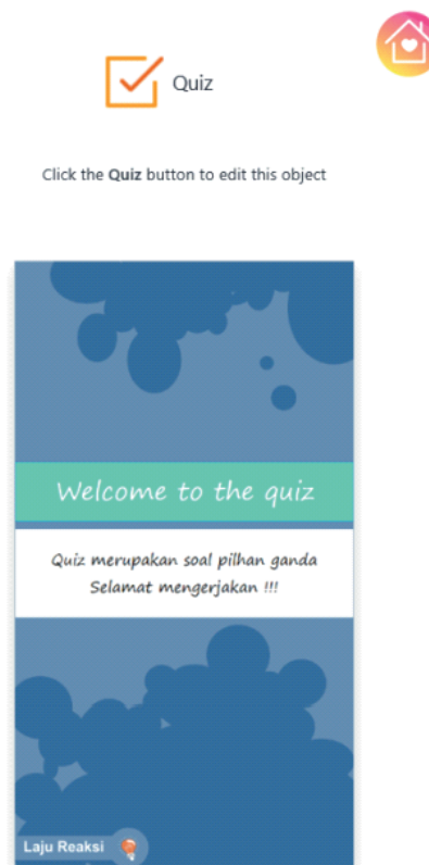
Figure 7: Display of the quiz menu.

of 100% (very valid), this is because the e-module media that is made is in accordance with the command with the display content or function.