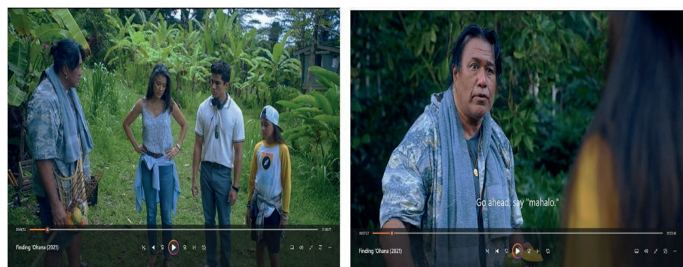
Figure 3: 00.06.52 - 00.07.27 time Meeting Papa Kimo.

The sequence depicted in Figure 2 reveals Pili’s transition from the familiar cityscape to an unfamiliar environment filled with greenery, animals, and a lack of people. She experiences a sense of disconnection as there is no WiFi available for her geocaching activities which she had invested so much into. Similarly, Ioane, being accustomed to city life like Pili, exhibits resistance towards his mother’s decision to reside in Oahu, Hawaii and feels restricted by his family dynamics leading to frequent arguments with Pili. However, the family’s arrival on the island sets the stage for new adventures. This storytelling technique commonly found in children and teenage adventure genres places characters in uncharted territories that test their survival skills and adaptability amidst change.