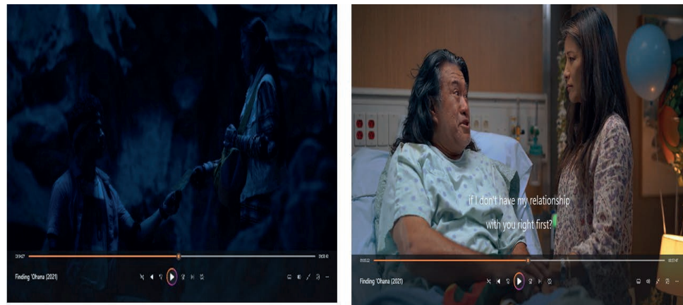
Figure 5: 01.04.27 and 01.05.22 time; Pili and loane being honest and reconcile while almost at the same time Leilani and Kimo also reconcile and make things better.

disappointment with Leilani or express his true emotions. This dishonesty becomes apparent when he appears disapproving and distant upon their return to Hawaii.