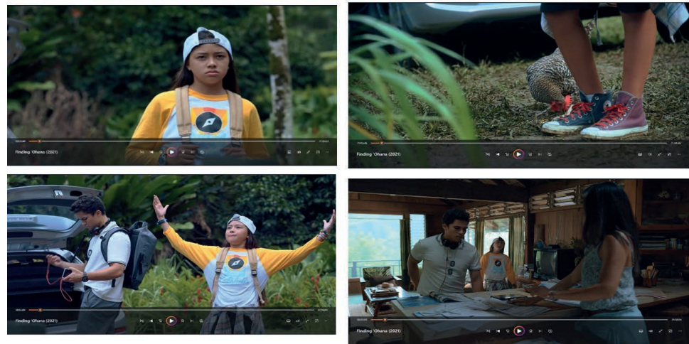
Figure 2: 00.03.40-00.05.05 time: Pili and family arrive at Papa Kimo’s house in Oahu, Hawaii.

appears overwhelmed by her children’s complaints and disturbed to discover that her childhood home is dirty and almost in ruins due to only her father living there alone.