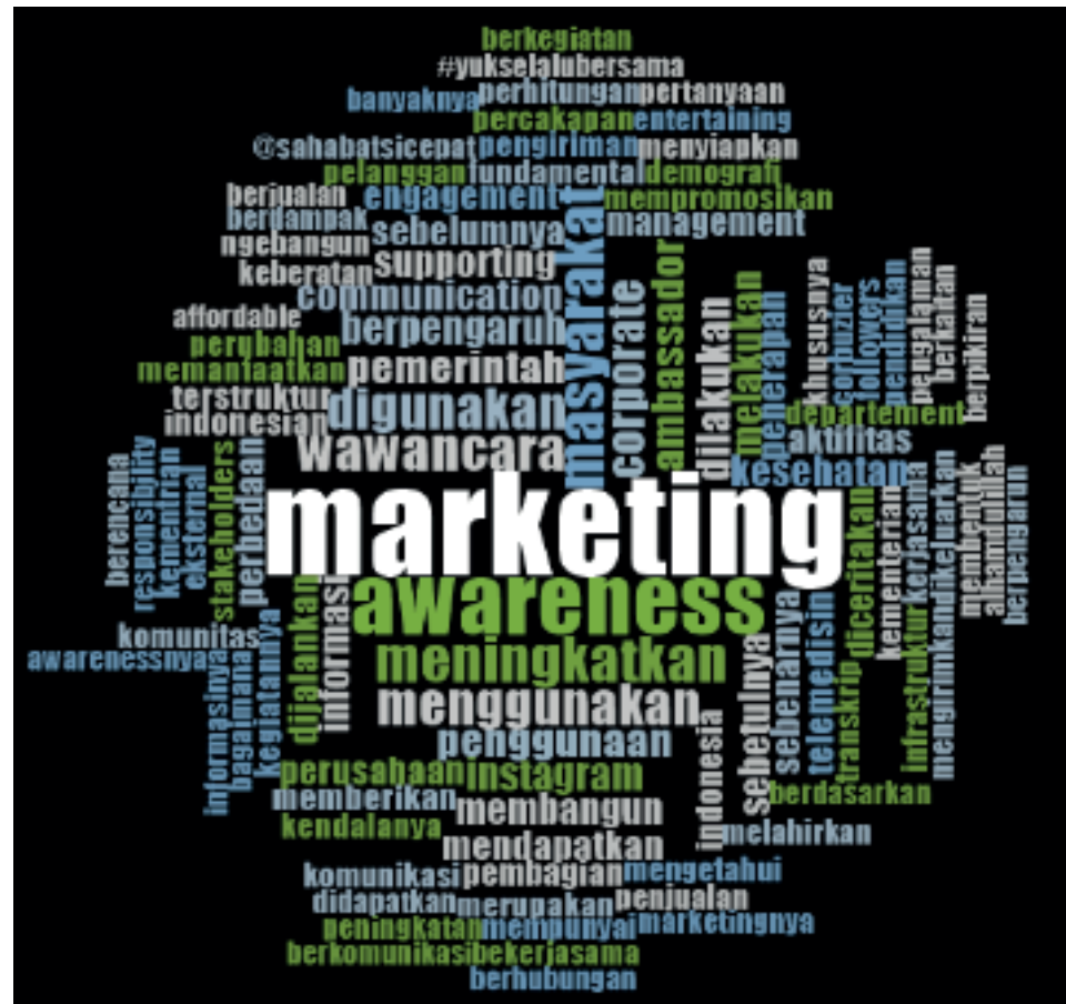
Figure 1: Word frequency.