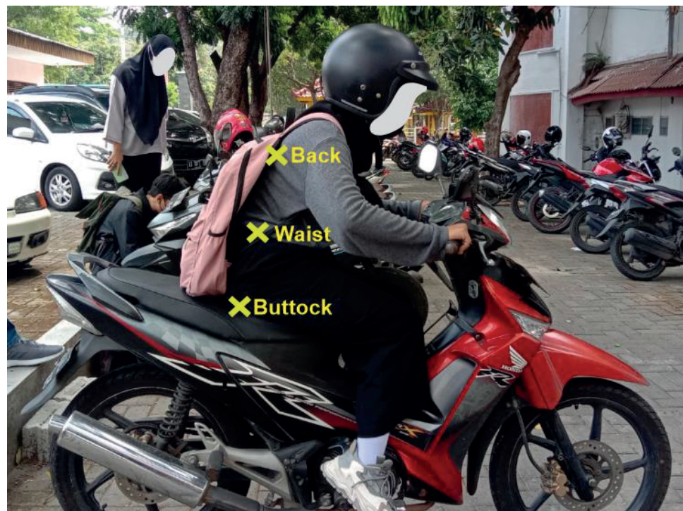
Figure 2: Path diagram of structural model in PLS.

The back plays an important role as a support for the body that is used to stand straight, walk, sit and perform activities flexibly. For online motorcycle taxi drivers, the dominant activity is sitting while driving. This has an impact on the back being the main complaint, then the waist and hips.