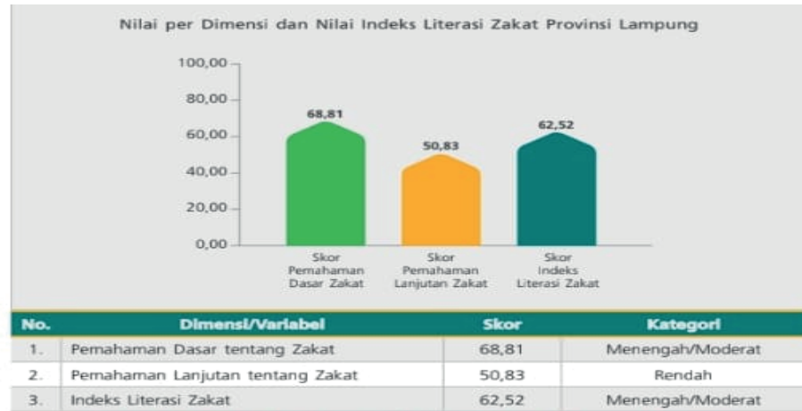
Figure 2: Value per Dimension of Lampung Province Zakat Literacy Index Value 2020.

and waqf [12]. The index value of Lampung province can be seen in Figure 2 as follows: