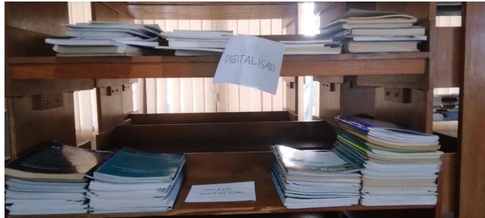
Figure 2: Digitalization Collection of the BRIN Bandung Djjunjunan Library.

In implementing the digitization of the gray literature collection, several obstacles were also encountered, namely limited facilities and infrastructure as well as human resources. The obstacle to facilities and infrastructure is the lack of representative equipment and space that can support the implementation of collection digitization. In facing these obstacles, librarians utilize existing facilities or use smartphones and modified parts of the library to carry out digitalization activities. The problem with limited human resources is the imbalance between the gray literature collection that will be digitized and the number of librarians available. Moreover, librarians also have other tasks that must be carried out, such as servicing and processing library collections. In overcoming this obstacle, BRIN librarians created an implementation schedule so that all librarians could come together to carry out digitalization activities that required teamwork. Apart from that, the library also collaborates with universities to collaborate on student internships to support the gray literature collection digitization program.