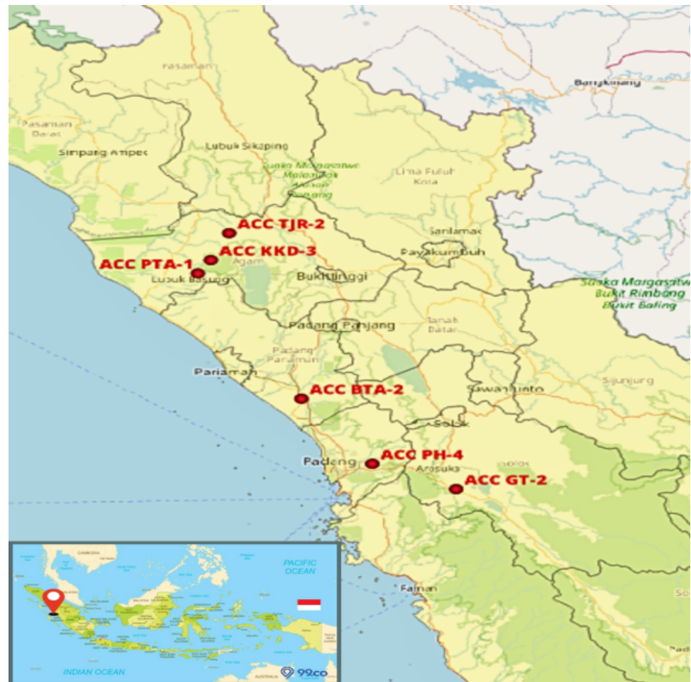
Figure 1: The locations where the six adlay accessions were found in West Sumatra Province, Indonesia.