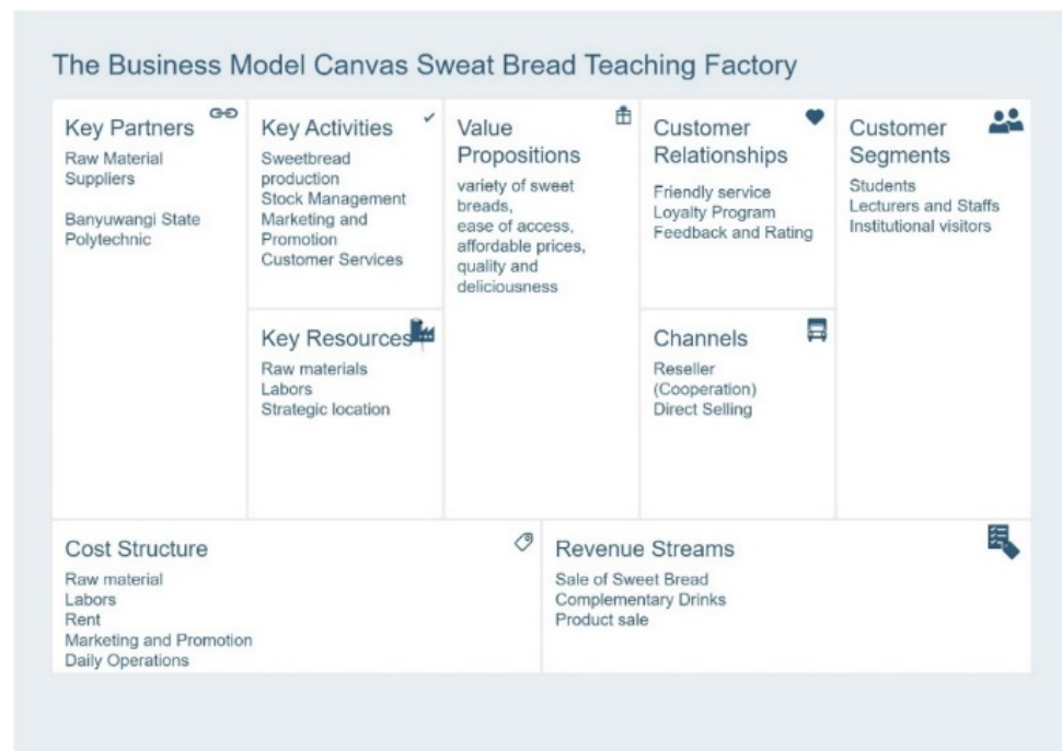
Figure 1: Business model of sweetbread teaching factory in Banyuwangi State Polytechnic using business model canvas.